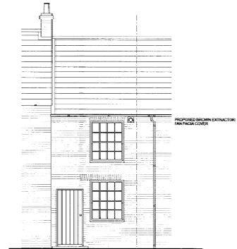
PROPOSED FRONT ELEVATION (SOUTH WEST) SCALE: 1:100